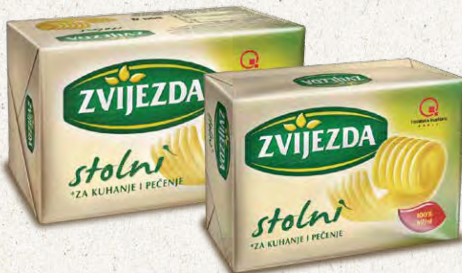
TABLE MARGARINE 80% FAT FOR CREAMS

Zvijezda's margarine makes creams and frostings smooth and voluminous, without creating lumps or concealing the fundamental flavor and color of the cream. It is used in confectionery and households for making various creams or stunning fillings for cakes and pastries. Enriched with a sweet cream aroma, it has a soft and spreadable texture, in order to make the cream as smooth and foamy as possible. It is recommended in the preparation of creams and frostings for well-known cakes, such as the Hungarian sponge cake, the classic chocolate or puff pastries stuffed with sweet vanilla cream or chocolate.