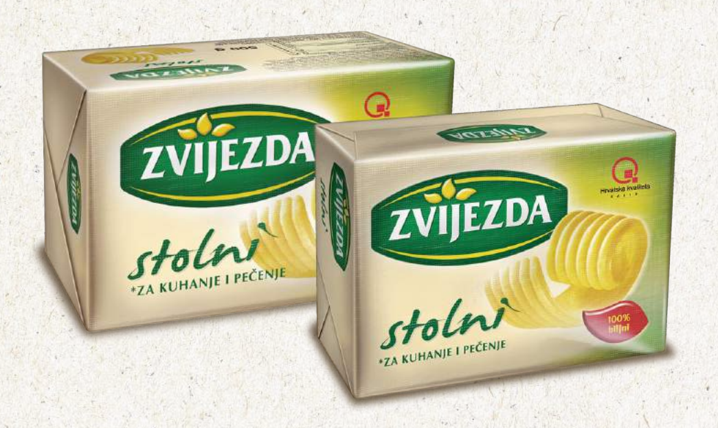
TABLE MARGARINE 80% FAT FOR CREAMS

Zvijezda's margarine makes creams and frostings smooth and voluminous, without creating lumps or concealing the fundamental flavor and color of the cream. It is used in confectionery and households for making various creams or stunning fillings for cakes and pastries. Enriched with a sweet cream aroma, it has a soft and spreadable texture, in order to make the cream as smooth and foamy as possible. It is recommended in the preparation of creams and frostings for well-known cakes, such as the Hungarian sponge cake, the classic chocolate or puff pastries stuffed with sweet vanilla cream or chocolate.